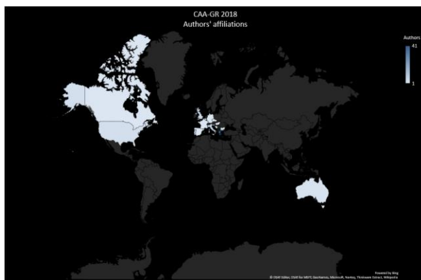
Figure 2. Authors' affiliations in the CAA-GR 2018.